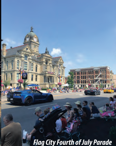
Flag City Fourth of July Parade