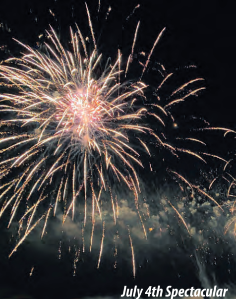
July 4th Spectacular