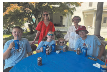
Fun was had by all at a previous July 4th Ice Cream Social.

224, Ottawa. Food vendors, house music, craft beer, ice cream and fun for the kids. Fireworks will be set off over the quarry about 9:30 p.m. Bring a lawn chair!