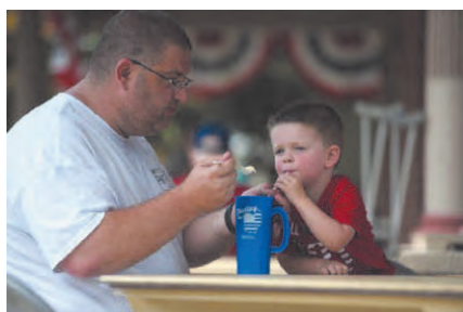
Attendees enjoy a previous 4th of July Ice Cream Social, hosted by Hancock Historical Museum.