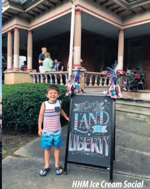
HMM Ice Cream Social