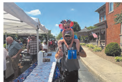
A father and daughter enjoying a previous July 4th Ice Cream Social.

July 3, festivities from 4-9 p.m. and fireworks shortly after that, Wood County Fairgrounds, 13800 W. Poe Rd., Bowling Green. Admission to Bowling Green’s 5th annual BG BOOM extravaganza is free for all. Enjoy games, inflatables, food trucks and live music in the afternoon before the show.